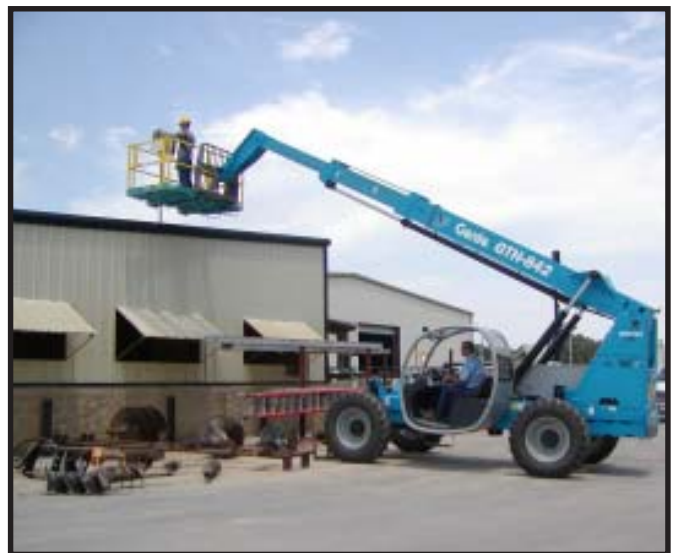
Faster Than Scaffold

Quick-Tach & Slip-on-Forks Models Available