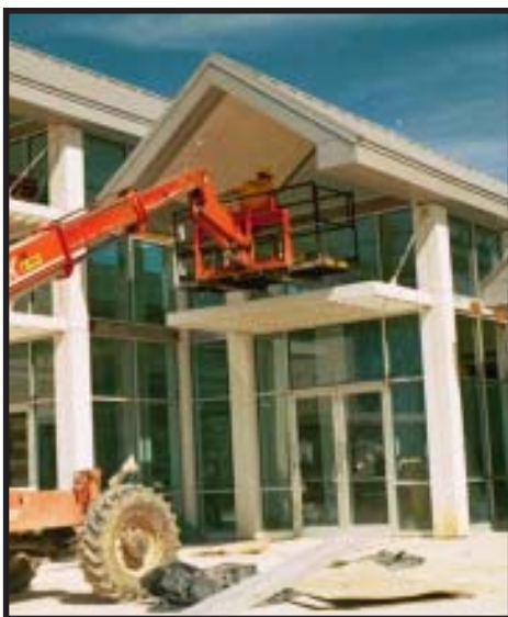
Goes Where Scissor-Lifts Can't

Quick-Tach & Slip-on-Forks Models Available